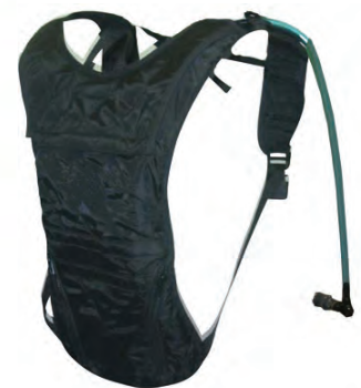
GULPZ - Personal hydration backpacks